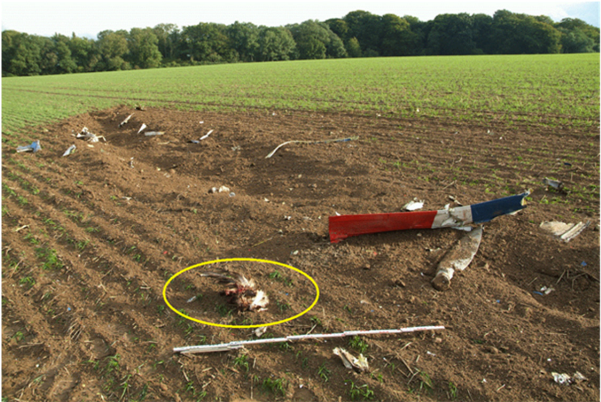
Accident site, view to the south-east, bird cadaver, left aileron and propeller blade