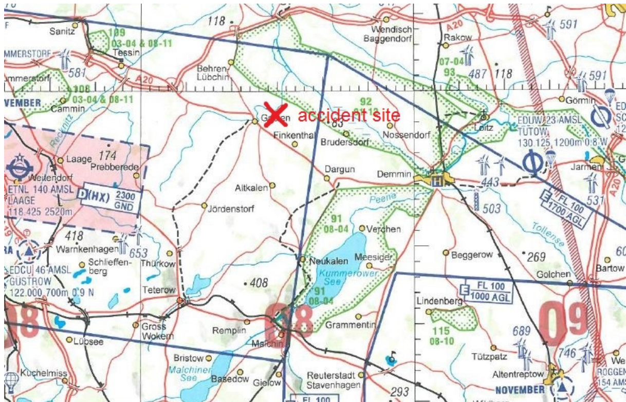
Excerpt ICAO chart with Aircraft Relevant Bird Areas 91 and 92