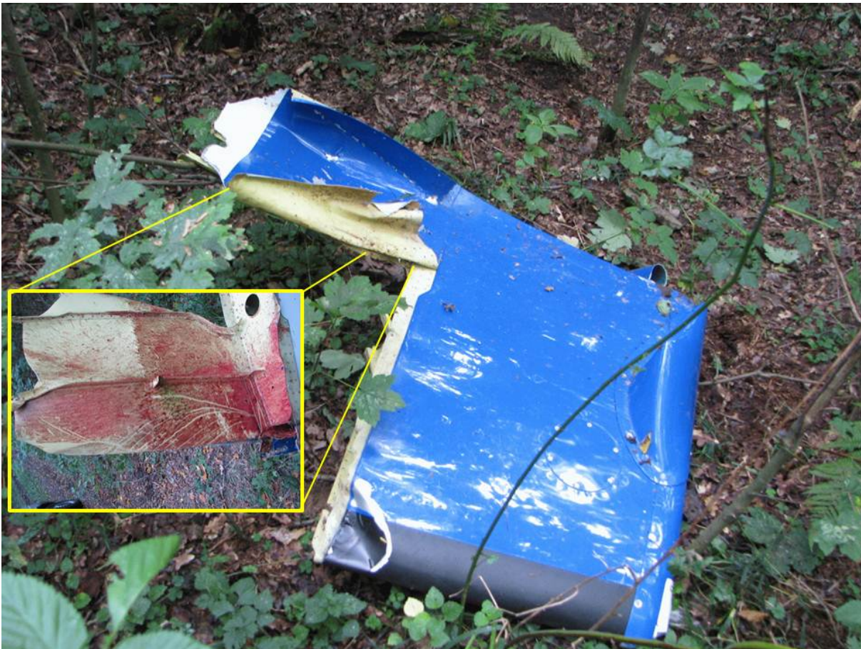
Part of the wing with traces of blood on the inner surface