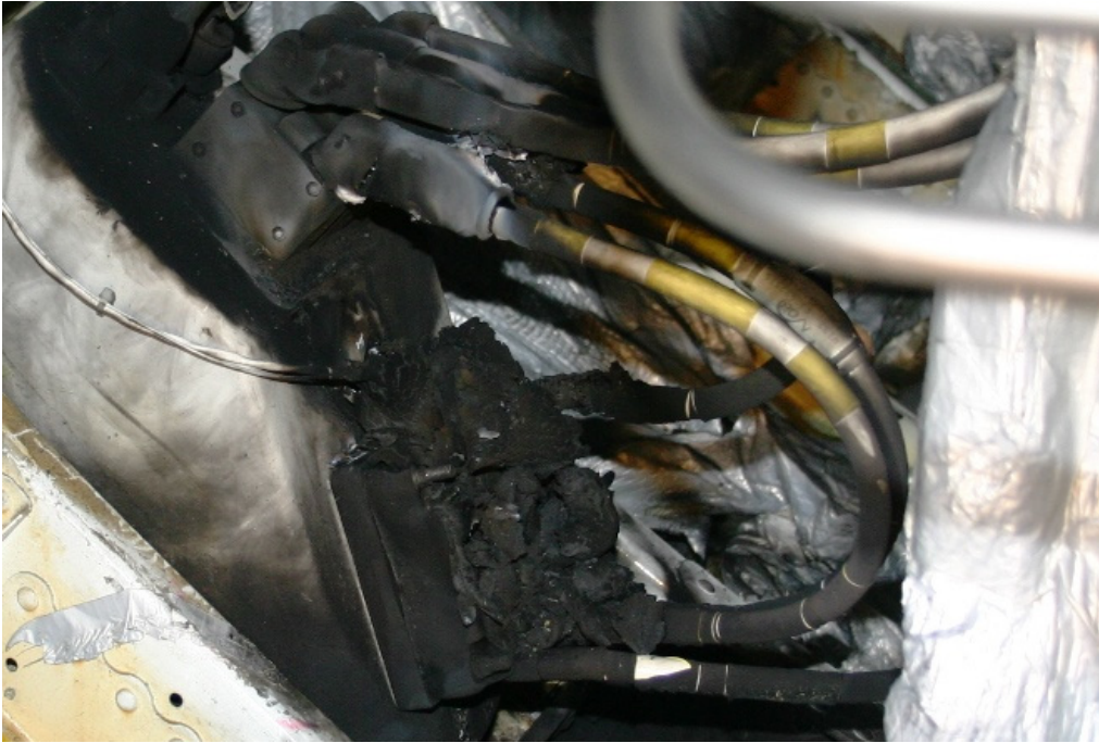
The inside of the external power receptacle