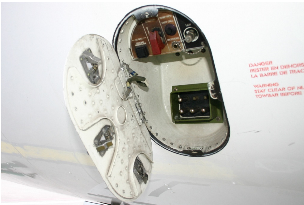
The outside of the external power receptacle

The outer area of the aircraft around the external power receptacle did not show any damage. The inside was covered by molten material, the connected cables and the circuit breakers located above were covered by soot. The wire bundles above the receptacle were covered by soot and the insulation of the pipes showed heat damage.