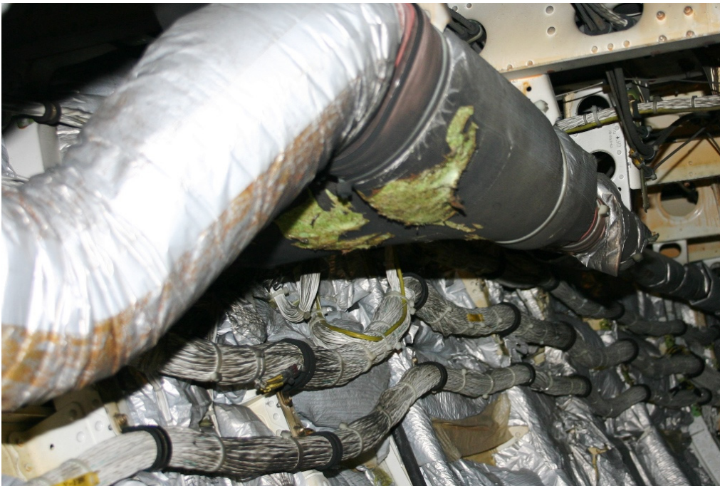
Area above the external power receptacle