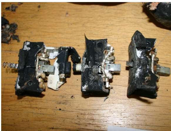
Automatic circuit breakers (overview) and the outside of the receptacle

The pins of the receptacle did not show any visible damages.