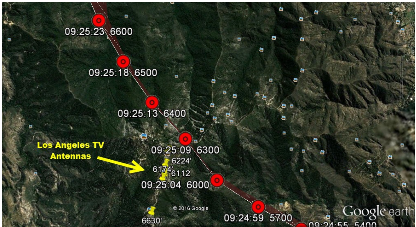
Figure 4 - Radar data overlaid on a Google Earth image with the TV antennas and the associated heights plotted.