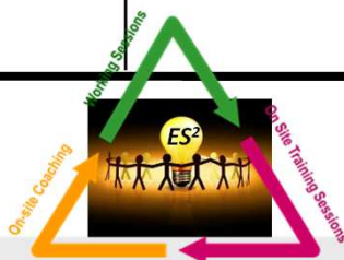
Safety FAB Roadmap