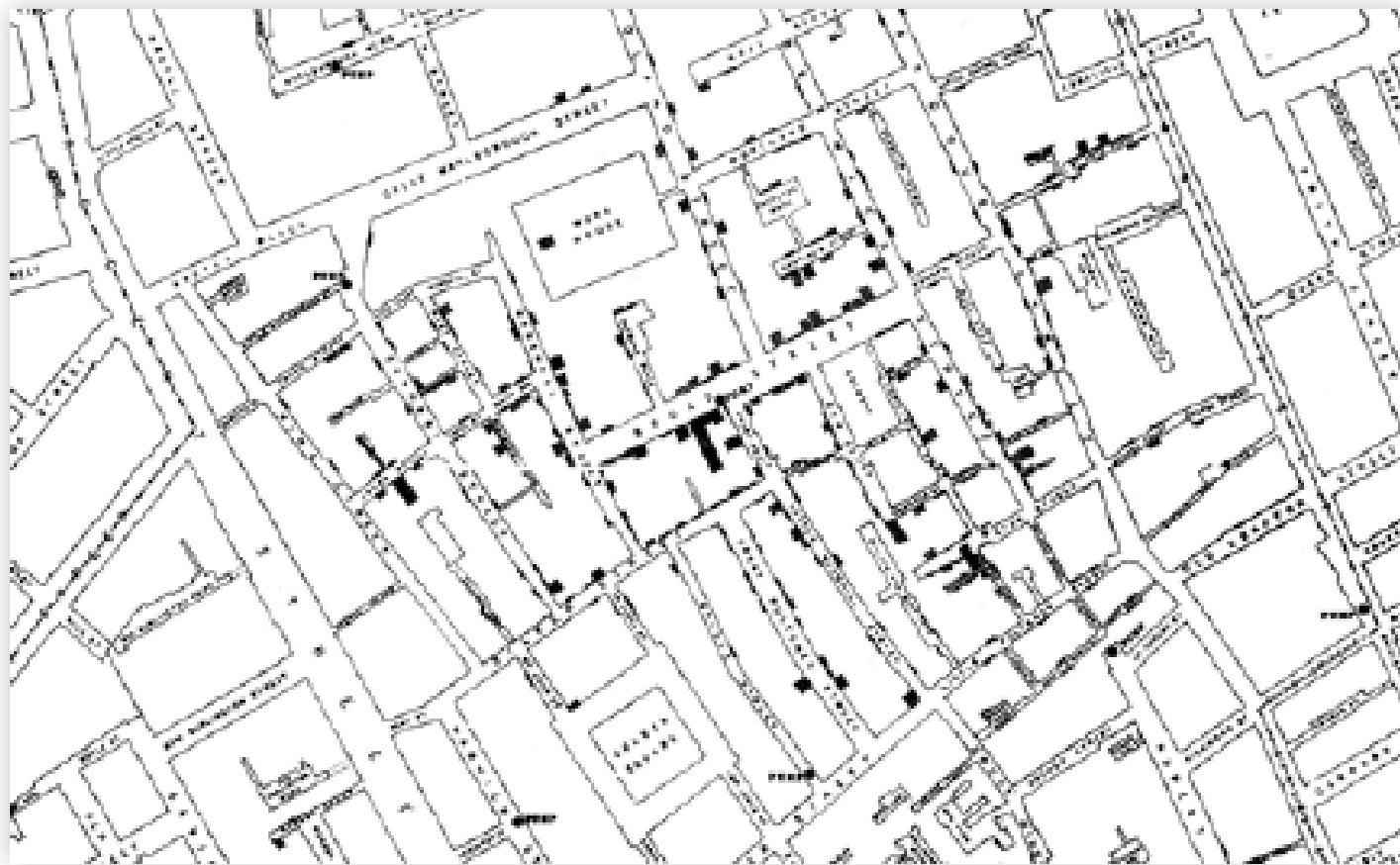
Dr John Snow 1854