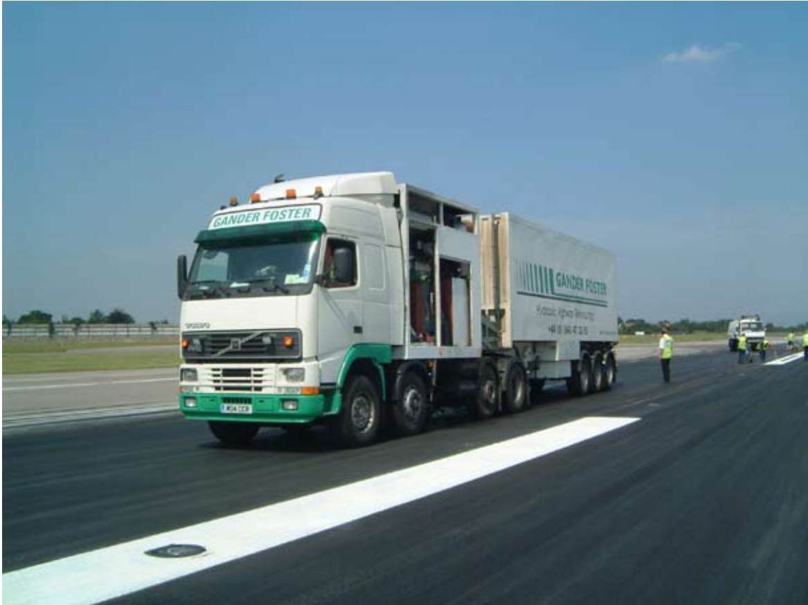
Rubber Deposits Removal Vehicle