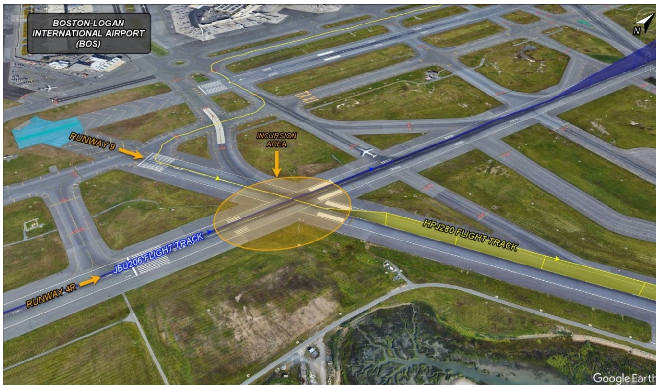
Figure 1. Flight tracks of both JetBlue (JBU206) and Hop-a-Jet (HPJ280) with yellow circle indicating incursion area.